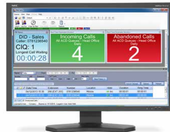
A real-time snapshot of all personal call activity including agent status, call history plus a mini wallboard of group activity

“Allows even a small team to deal with fluctuating call traffic”