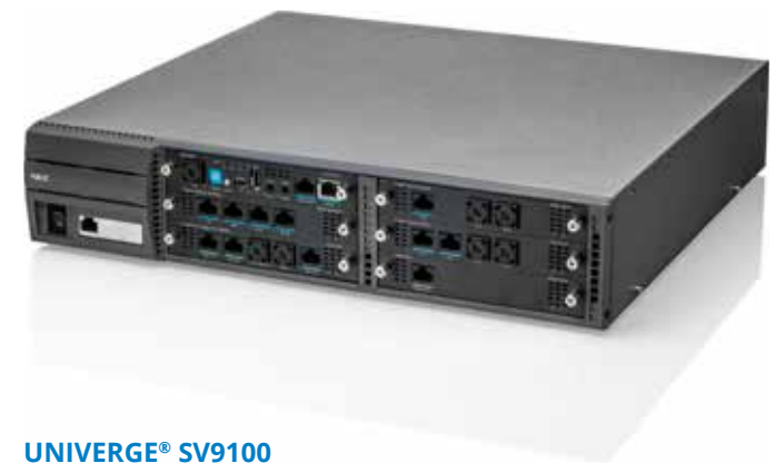
UNIVERGE® SV9100 Free MyCalls Desktop Lite

FREE with every SV9100 - a slimmed down version of MyCalls Desktop – this offers similar functionality bar, presence and 10 as opposed to 1000 DSS (Speed Dial & Busy Lamp Field) keys.